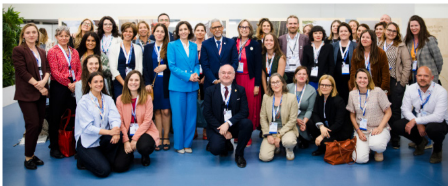
Over sixty Red Cross/Red Crescent representatives participated in the European Humanitarian Forum 2025 where they met with Hadja Lahbib, European Commissioner for Preparedness, Crisis Management, and Equality.