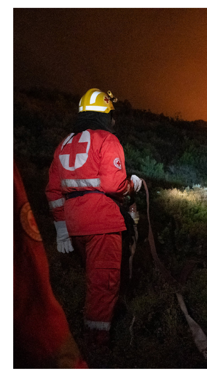
In August 2021, Greece was engulfed in flames for days and thousands of people were evacuated from around Athens. Hellenic Red Cross teams are worked day and night, distributing basic necessities for rescue teams and the people affected.

This strategy will be complemented by a monitoring and evaluation (M&E) framework that will be developed in 2022. The Red Cross EU Office will also elaborate annual work plans that will translate the strategy into yearly objectives. The M&E framework and annual work plans will be integral to operationalising the Red Cross EU Strategy 2022-2027. A mid-term review of the strategy is foreseen to check progress and make any necessary adjustments to reflect the changing context.