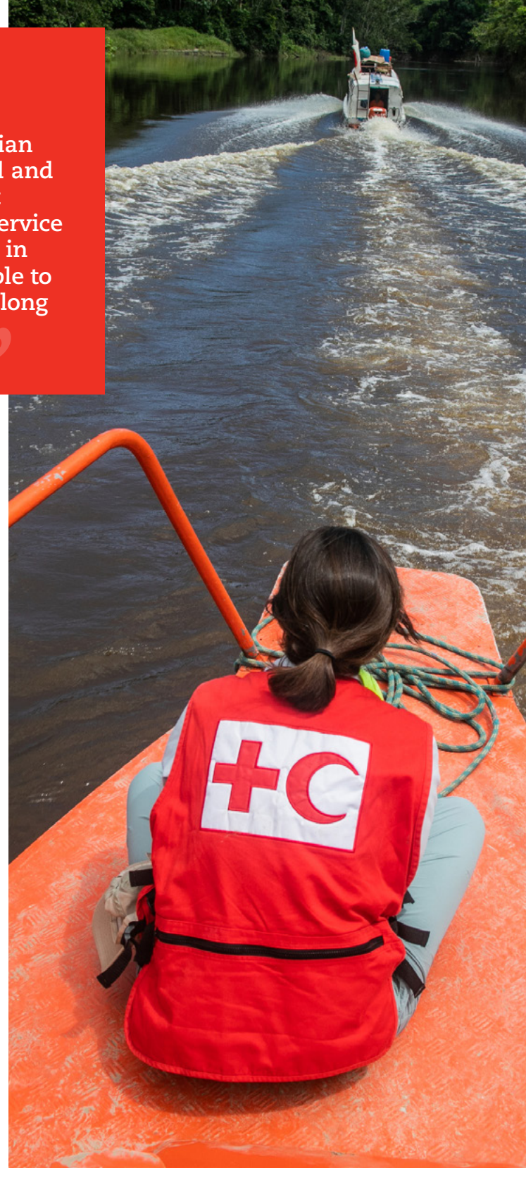
Supporting the national vaccination campaign against COVID-19 of the Health Ministry of Peru for indigenous communities, the Peruvian Red Cross, the IFRC and the ICRC implemented a project to facilitate community dialogue and logistical support to vaccinate hard-to-reach communities, October 2021.

We are one of the largest humanitarian actors in the world and among the biggest non-profit social service provider networks in Europe, and are able to work all the way along migration routes from country of origin to country of destination. In this capacity, we will engage with the EU in its priority areas to strengthen the position of members in fulfilling our humanitarian mandate of serving the most vulnerable people.