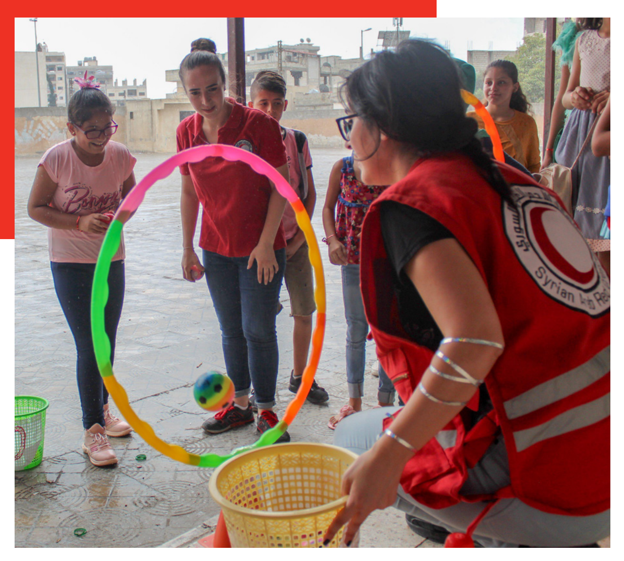
Syrian Red Crescent volunteers provide psychosocial support as well as other relief for the most vulnerable people affected by the crisis, August 2021.

Our focus over the coming five years will be to highlight the humanitarian consequences of EU policies on the needs of vulnerable people and communities according to the five global challenges identified in the IFRC Strategy 2030. Based on Red Cross EU Office members' experience, we will promote EU policy measures, programmes and practices to address growing needs inside and outside the EU.