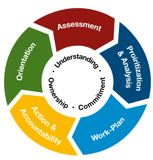
The five key phases of the cyclical PER process

Through the PER approach, National Red Cross Societies undertake a comprehensive review of their disaster response system, looking at five inter-related areas – 1) Policy, Strategy and Standards, 2) Analysis and Planning, 3) Operational Capacity, 4) Coordination, 5) Operations Support – and 37 components that form a National Society Disaster Preparedness Mechanism. The PER process is made up of five key phases: