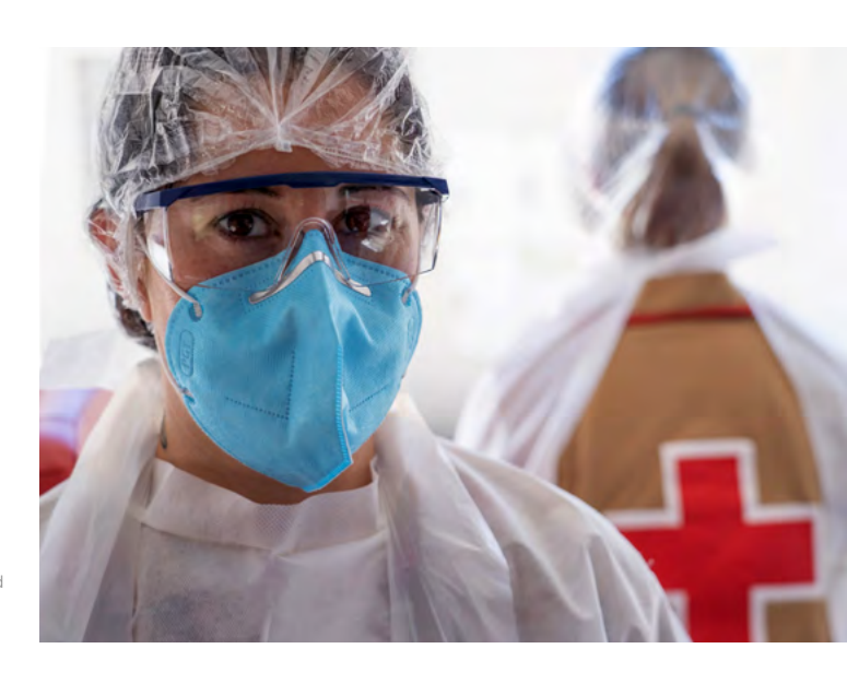
Portuguese Red Cross teams continue assisting people affected by the COVID-19 pandemic.

Recently, many new types of emergencies have been identified and prepared for. One of them concerned the Vaclav Havel Airport Prague, an important flight hub in Central Europe. An increasing number of flights together with more frequent weather events increases the likelihood of cancelled or diverted flights and raises the risk of aeroplane accidents. The Czech Red Cross is now prepared to ensure psychosocial support, emergency accommodation and food for hundreds of people with high stress levels, in cooperation with the airport and some of the airlines. It has already set up a temporary assistance centre for emergency situations several times. Regular trainings and exercises are organised to ensure capacities are in place and procedures are known among staff and volunteers