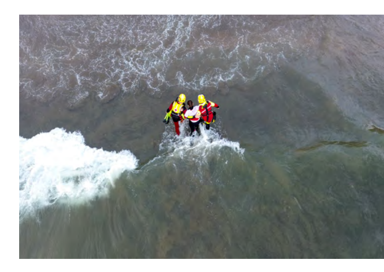
Italian Red Cross volunteers rescuing a woman in Cercola in 2019.