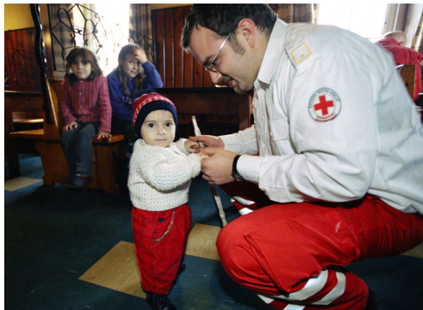
'AUSTRIA, Providing assistance in Red Cross housing for asylum seekers in Steyr

28 National Societies in the European Union and Norway form part of the world's largest humanitarian network, and employ over 250,000 staff. They also engage well over one million volunteers, and have more than eight million members. The Red Cross EU Office represents their interests, as well as those of the International Federation of Red Cross and Red Crescent Societies (IFRC), before the European Union (EU) and its institutions.