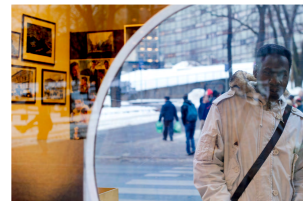
'NORWAY, Health center for irregular migrants in Oslo, 2011