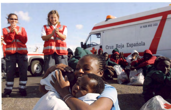
SPAIN, A mother reunited with her children after arriving on the Island of Fuerteventura, Canary islands, 2006.

At the 31st International Conference of the Red Cross and Red Crescent the Movement (5) in 2011, States agreed to work towards enhanced cooperation between public authorities at all levels and National Red Cross and Red Crescent Societies in order to promote respect for diversity, non-violence and social inclusion of all