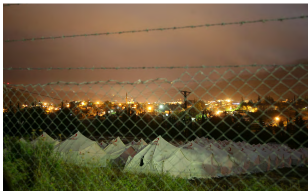
TURKEY, Turkish Red Crescent camp set up to welcome Syrians fleeing unrest, June 2011